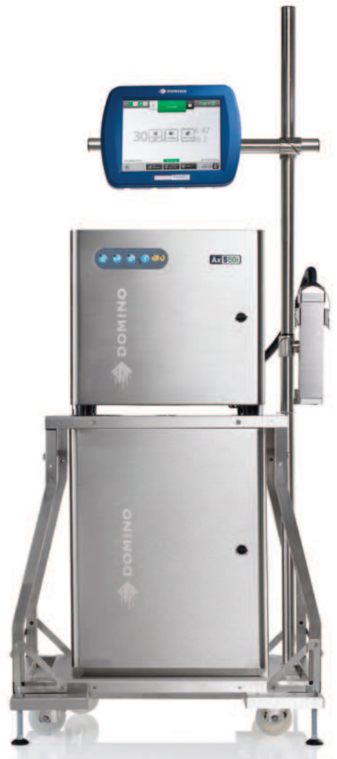
Ax550i – in harsh environments you can't beat the Ax550i