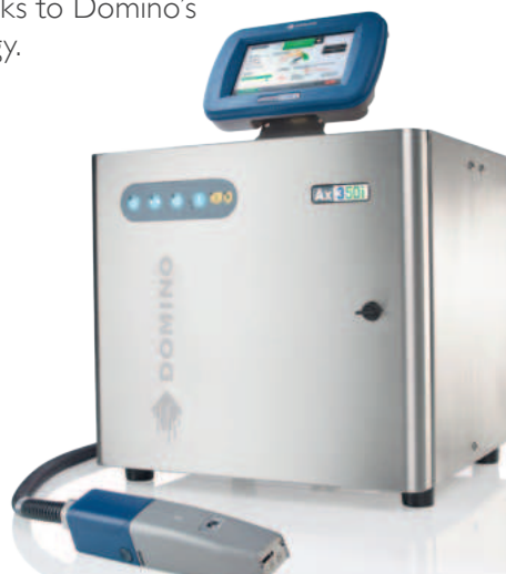
Ax350i – all the flexibility CIJ has to offer