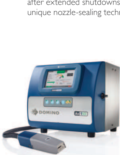
Ax150i – an ideal solution for all your basic coding needs